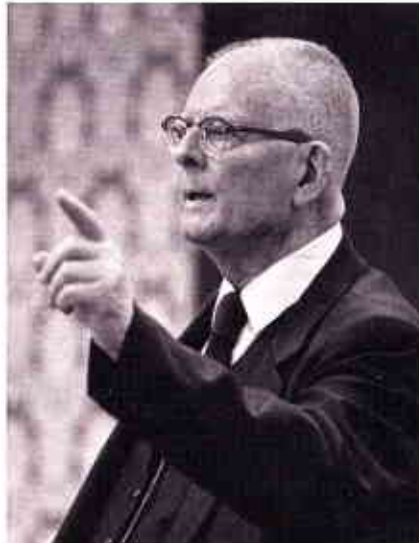
W. Edwards Deming

to see just how relevant Deming's simple truths are: Detroit continues its decades of wrestling with Asian competitors; legacy airlines are successfully challenged by new upstarts offering better service at a lower cost; American healthcare has become the world's most expensive while producing staggering levels of deadly medical errors; and the country is spending more and more on education, only to see the world ranking of its students continue to decline.